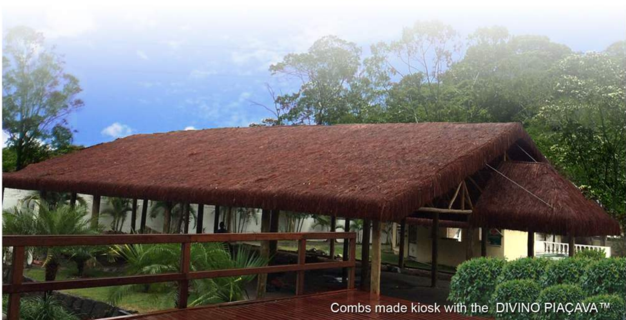
Combs made kiosk with the DIVINO PIAÇAVA™

Fully sustainable product and use in various segments of construction; architecture ; landscaping and decoration. Besides the ease , convenience and economy in construction works in palm fiber , as well as kiosks ; covers; chalets ; recreational areas ; decks ; bungalows ; scenarios; umbrellas ; pergolas ; roofs rustic ; hovels ; huts ; barbecue grill Stands ; Beach homes or vacation ; designs landscaped gardens in ; saunas ; areas with hot tub or hydro spa; harsh environments; thatched roofs or roofs of palm fiber.