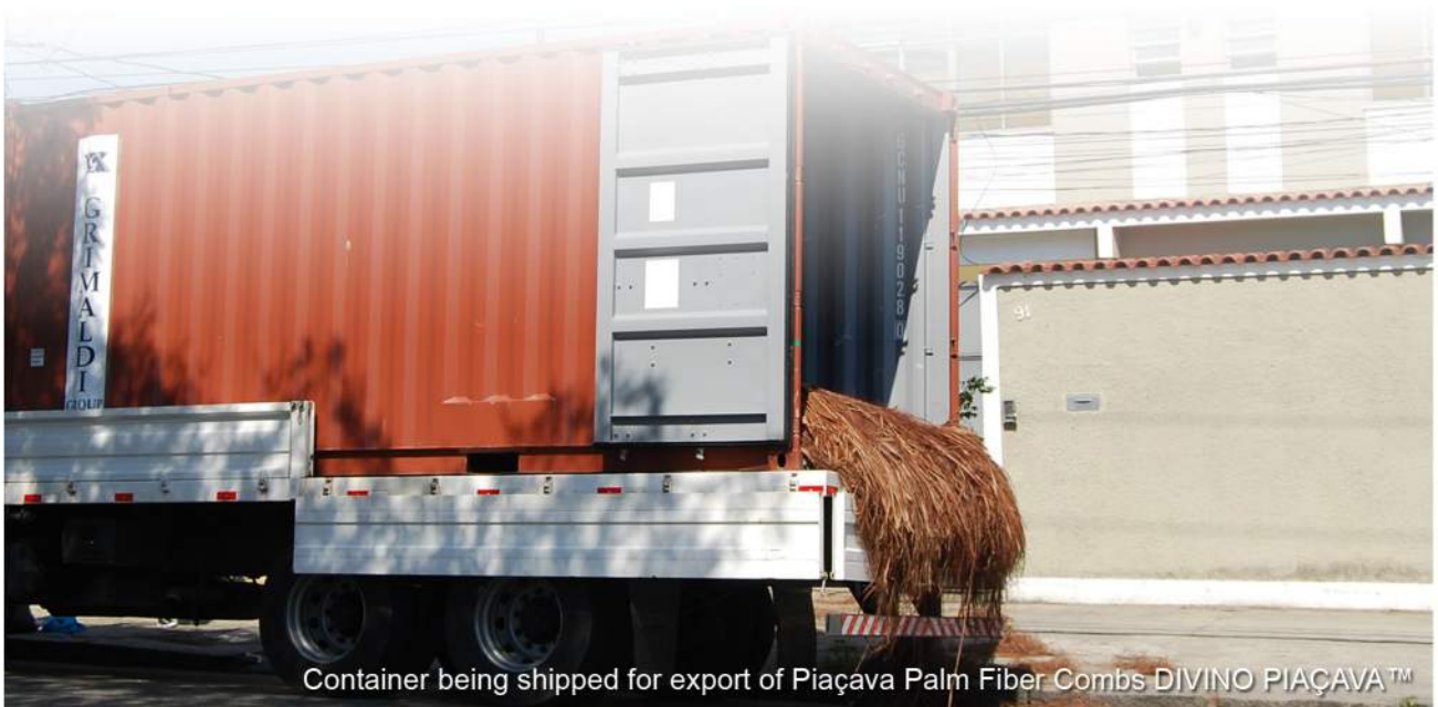
Container being shipped for export of Piaçava Palm Fiber Combs DIVINO PIAÇAVA™

In addition, we also serve the foreign market . Given mainly throughout the Americas , Asia and Europe , with sending cargo through modal maritime .